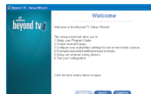
Beyond TV's Setup Wizard

Note: A SnapStream.Net account is required to schedule recordings from any web browser or WAP-enabled cell phone.